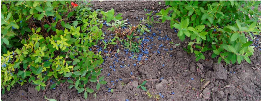
Figure 5. Two conditions are needed for fruit drop: a variety that lets go of its fruit easily and something to jostle the bushes; something like wind, hail or waxwings.

machine they turn black. We have an article on our website called “Dried Haskap” with more details on this. Drying haskap on bushes should be considered highly experimental and we really don’t know if it is feasible.