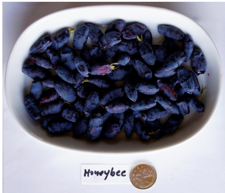
Figure 3. 'Honey Bee's fruit is cylindrical. The original bush is rather young so fruit size will likely increase when the bush gets older. Notice that some of the stems are still holding onto the berries.

Pacific'). But it pollinates them well because its parents are not closely related to 'BTI's parents. But both of 'Honey Bee's' parents are taller than 'BTI's and it is suspected that it will grow to be 2 feet or so taller than 'BTI'. The original plant of 'Honey Bee' is at least 50% taller than the 'Borealis' plants in the same row.