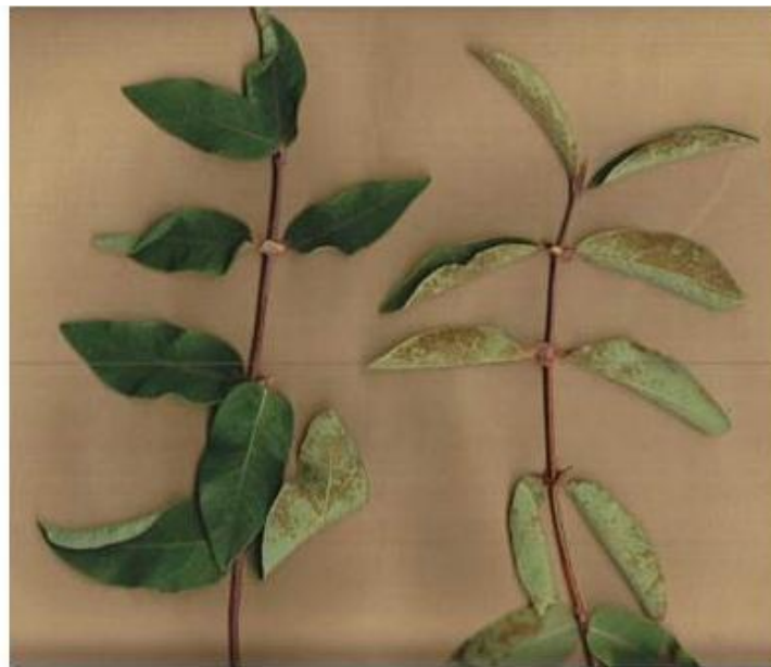
Berry Blue (Czech#17)

rated as productive, good tasting, vigorous, and bearing fruit at a young age. 'Honey Bee' was one of the few good producers at only 2 years old. All 6 selections were put into tissue culture to evaluate relative ease of propagation and Honey Bee was the fastest multiplier. The next season we observed the timing of flower opening and did controlled crosses with all 6. 'Honey Bee' was the best choice because it alone bloomed at the right time and gave good fruit set when crossed to 'Borealis' and 'Tundra'. We did not test the 'Indigo' series are siblings of 'Borealis' and 'Tundra' and should work well with 'Honeybee'.