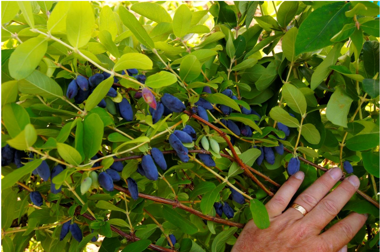
Figure 1. 'Honey Bee' bush showing productive branches,

'Honey Bee' was selected to be a pollinator for 'Borealis', 'Tundra' and the 'Indigo' series. (I'll call them 'BTI') It blooms at the same time and has given good fruit set when used in controlled crosses with them. It is very fast growing, productive and starts fruiting at an early age.